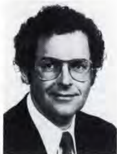
Minister of Communications